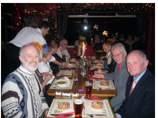
Our guests from NUSC enjoying the Christmas Dinner at the Old Ferry Inn